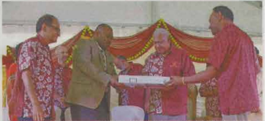
Prime Minister Voreqe Bainimarama with the Minister for Health and Medical Services Dr Ifereimi Waqainabete at the inauguration of the children's heart screening centre within the Sai Prema Foundation Fiji on April 24, 2019.