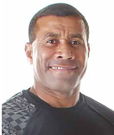
Mr. Waisale Serevi Fiji Rugby Legend and Sporting Icon